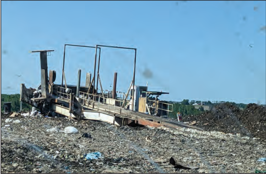
Cover spread around tipper