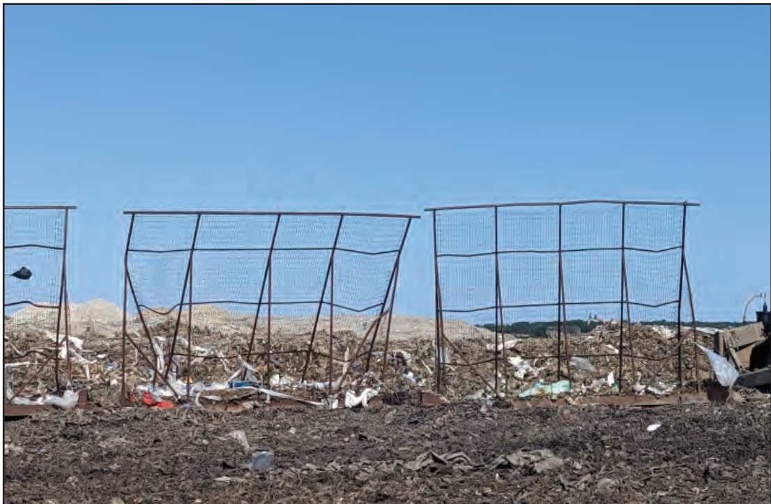
Working face covered for the day