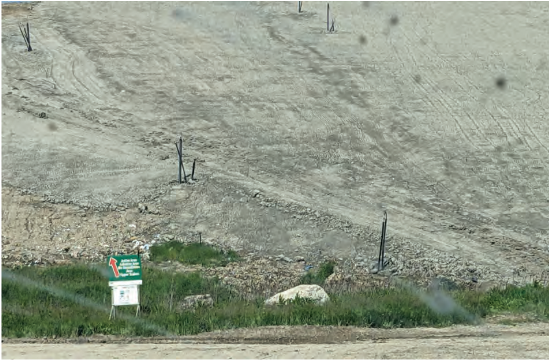
Clay cap nearly complete