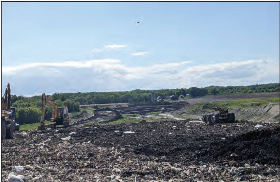
Cover placed for end of day