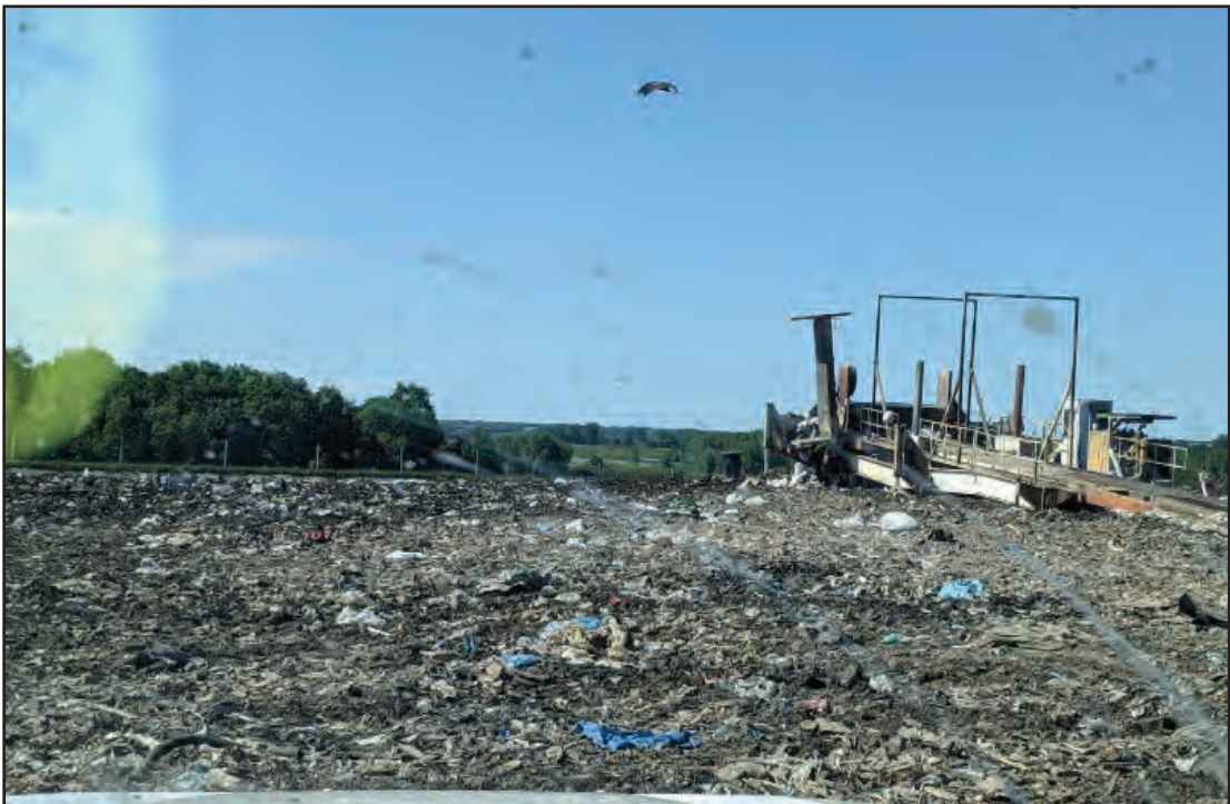
Working face covered for the day