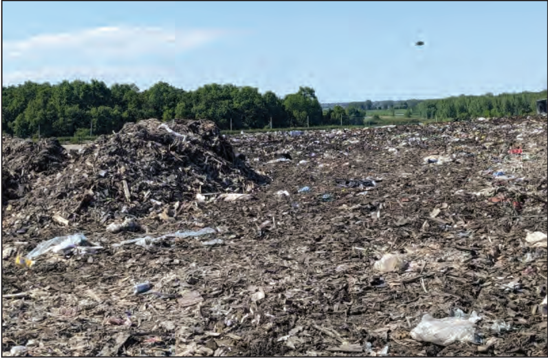
Cover and stockpile of wood chips