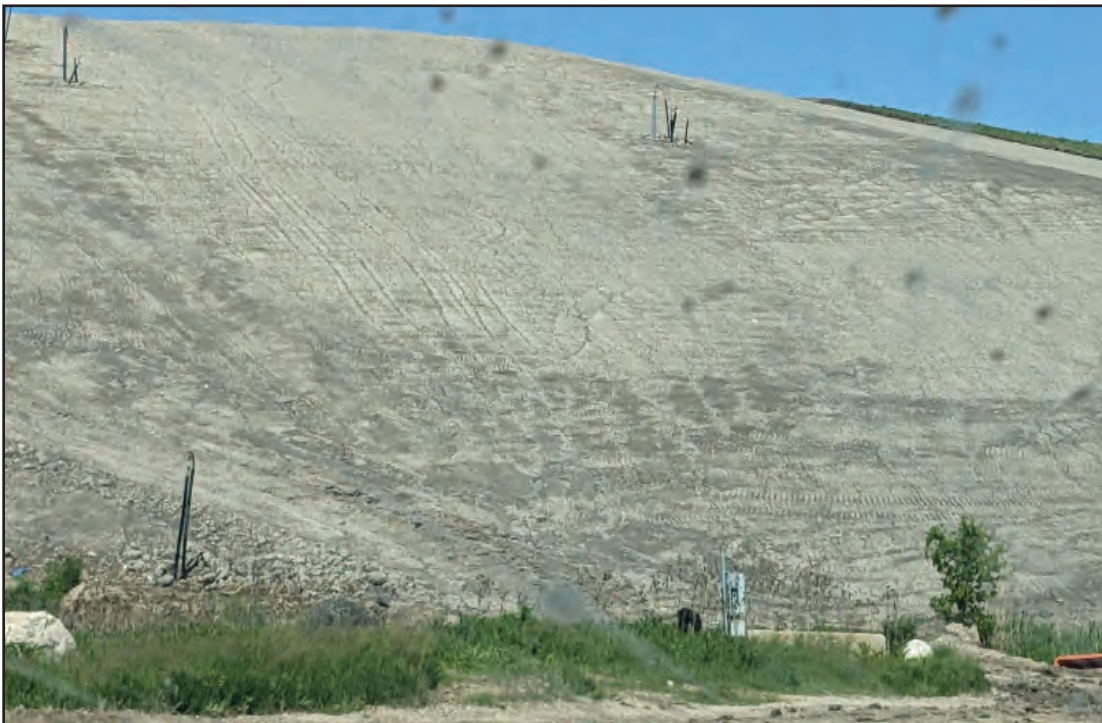
Trimming waste elevations prior to cap placement