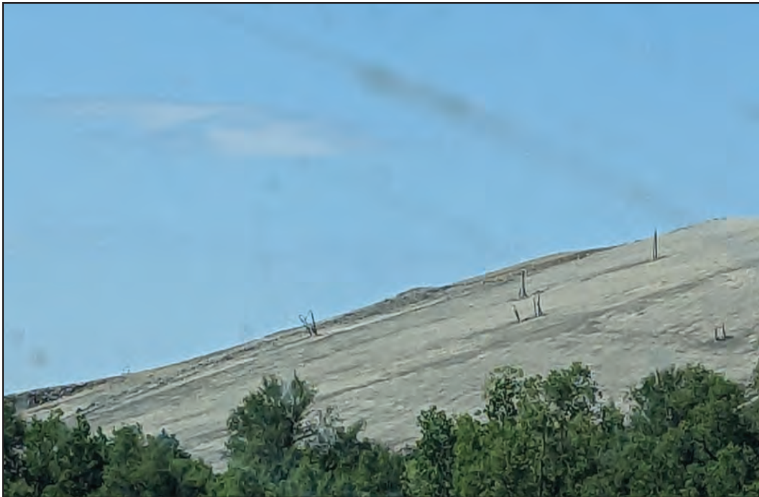
Next cap project starting