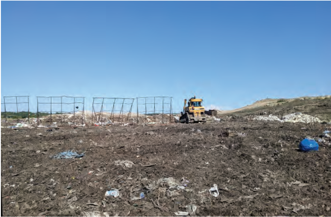
Working face covered for the day