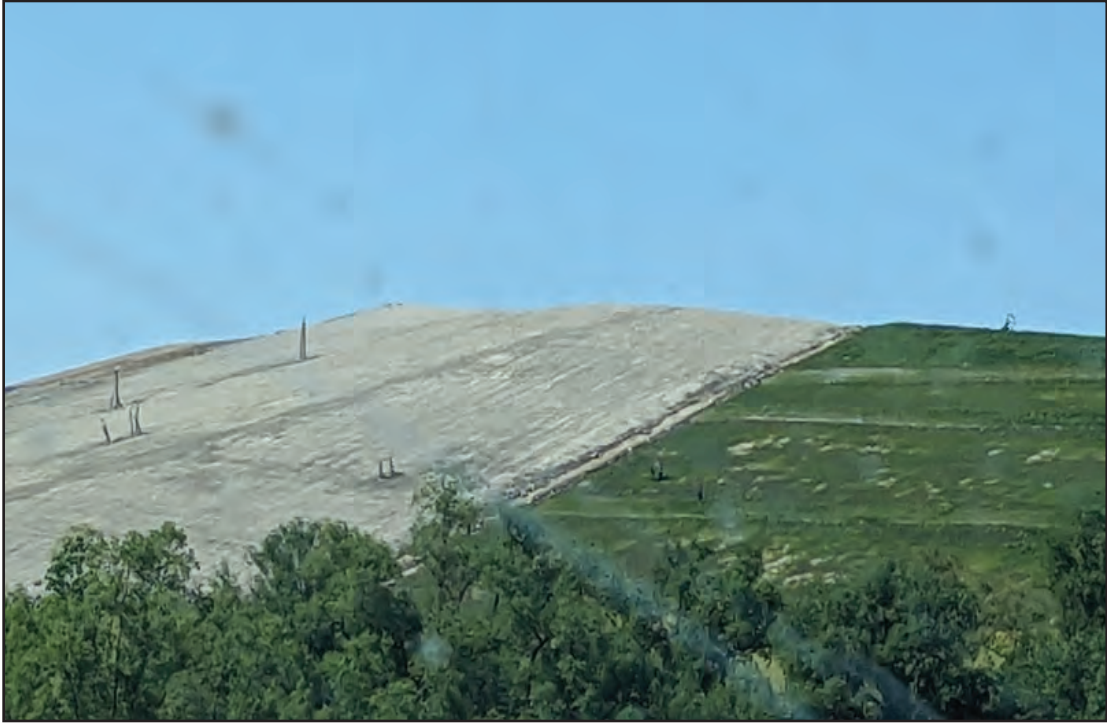
Clay cap nearly complete