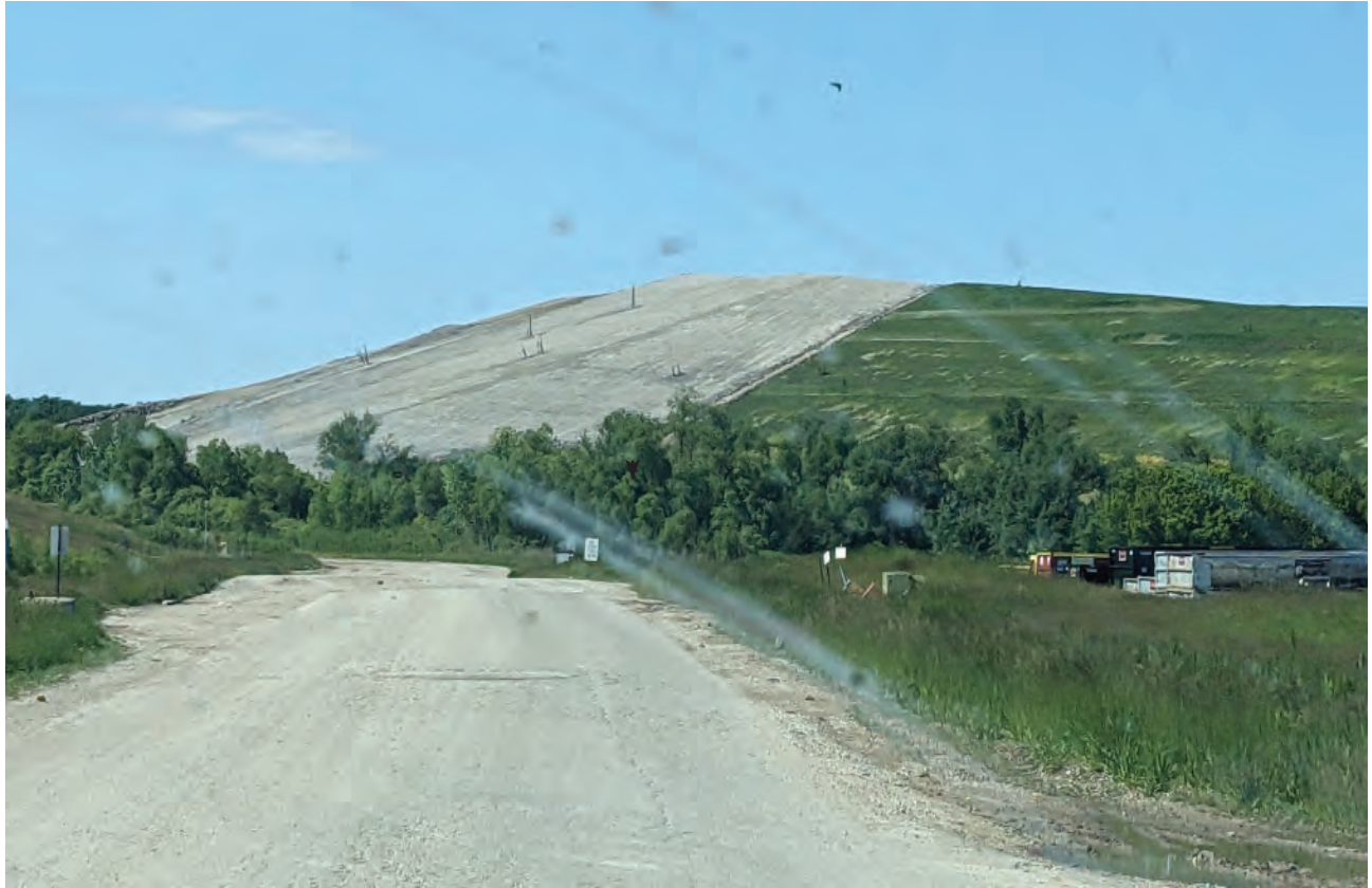
Clay cap nearly complete, when finished plastic will be placed